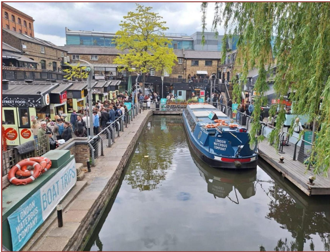
Camden Lock

Our April trip took us to the Ramses and Pharaohs of Gold exhibition , showcasing many artefacts, including gold masks, jewelry, animal mummies and coffins. Ramses II ruled Egypt for 66 years, the second longest in Egyptian history and he is thought to be Egypt's most successful warrior pharaoh. His reign saw extensive