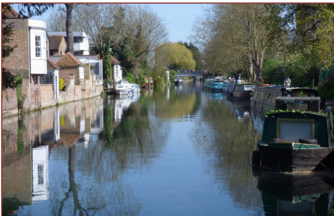
River Lea at Ware

We meet on the second Wednesday of every month and our next meeting will be on Wednesday 10 th June when we are planning an outing for a photo shoot of urban infrastructure around the Google data centre in Cheshunt. Meet at Cedars Park at 2.00pm , more