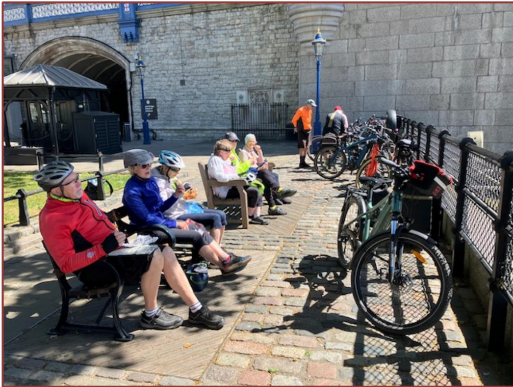
U3A Distance Riders at the Tower of London