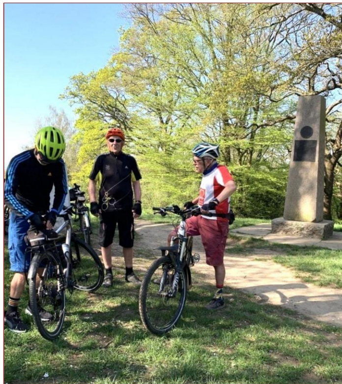
Challenger Riders at Pole Hill