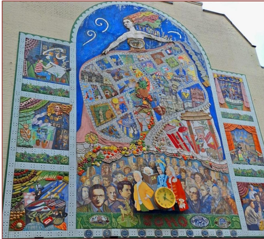
Soho Mural

At the end of March, the group enjoyed a guided walk around the narrow streets of Soho. The interest was such that two walks were arranged for both the morning and the afternoon. We heard how the area changed from a Royal hunting ground into a fashionable suburb for the aristocracy, then later became home for artists, writers and migrant communities.