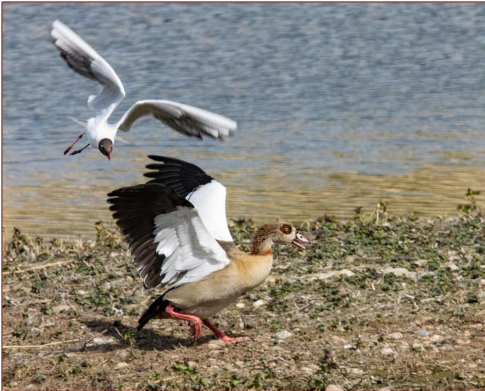
Beligerant Blackheaded Gull

spending a couple of hours visiting hides, and on a gentle stroll, watching birds as we go. Contact is Brian Fitzjohn 07709 455991.