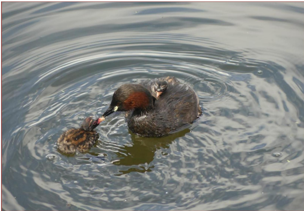
Dabchick and Chicks