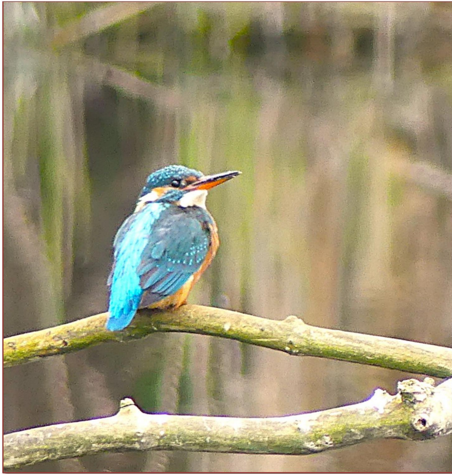
Kingfisher at Rye Meads