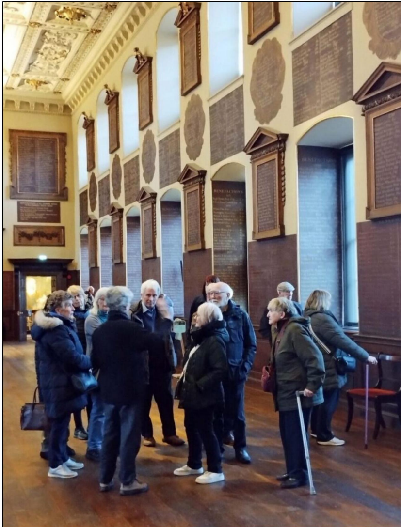
EL Group 3 at Bart's Great Hall