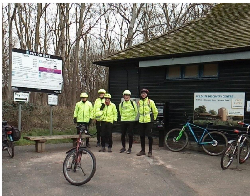
The Easy Riders at Fisher's Green