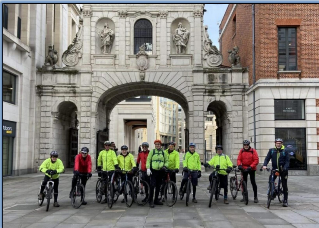
Cycling Group at Temple Bar (and no, you can't get a pint there!)