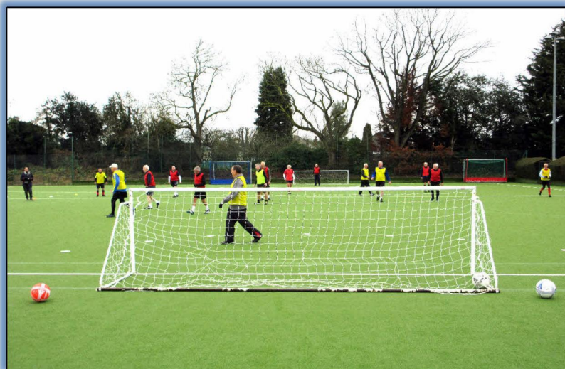
Walking Football Group