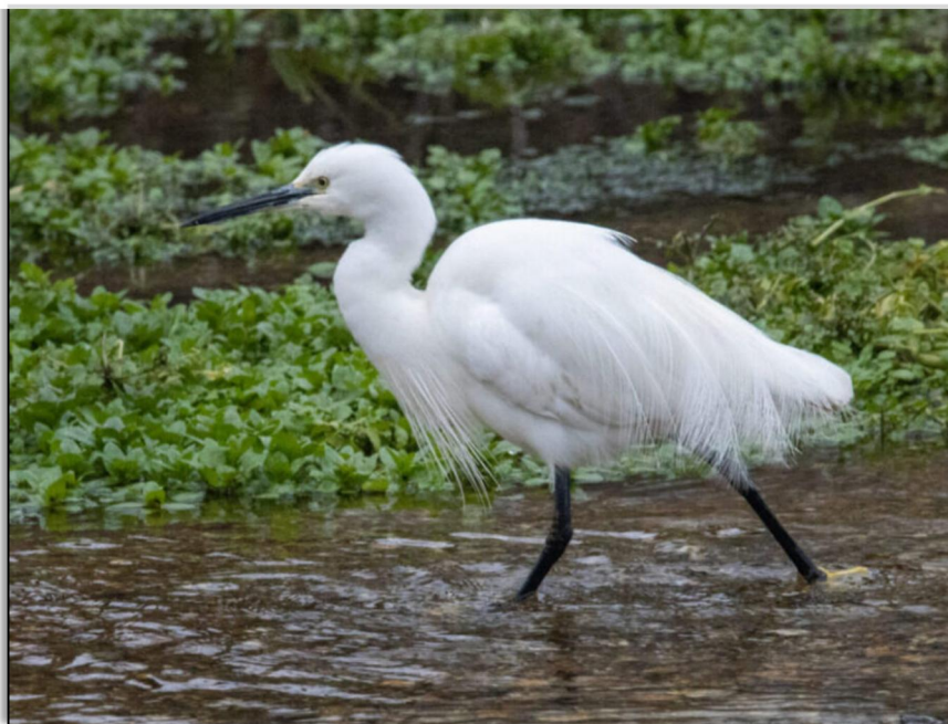
Striding Out - the bird watching group at Lemsford Springs

Alternatively, you can obtain a printed copy by contacting the Membership Secretary by phone or at a monthly meeting. Members' information held by Cheshunt u3a will not be disclosed to any third party.