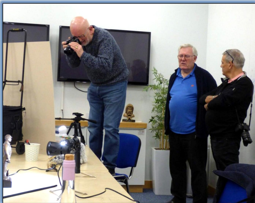
What some Photographers will do.....