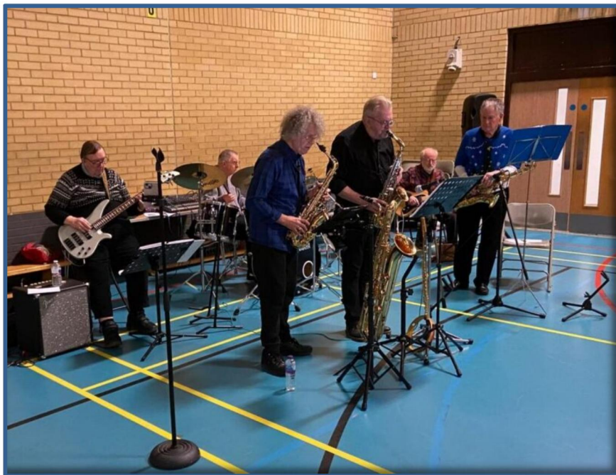
The A Train at our Xmas Meeting