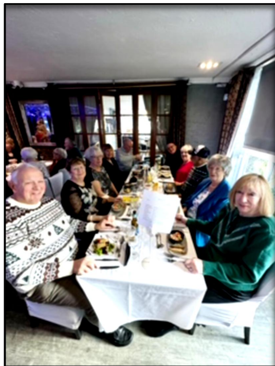
Hunter's Meet Christmas Dinner