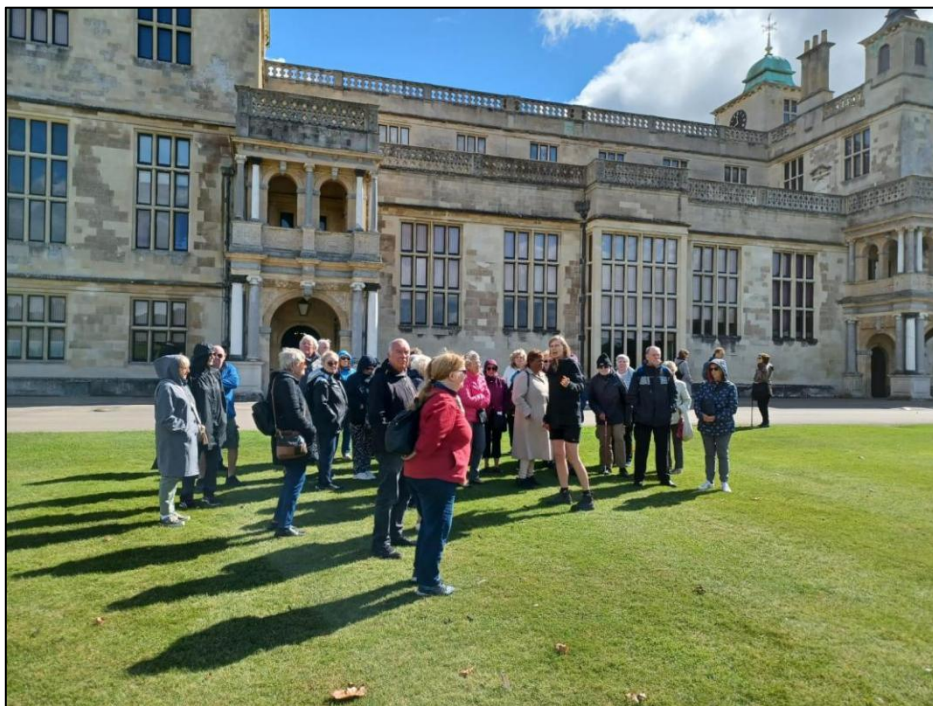
ELG4 at Audley End House