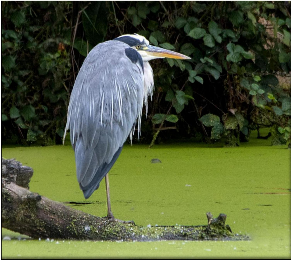
Big Brother is Watching You! / Grey Heron