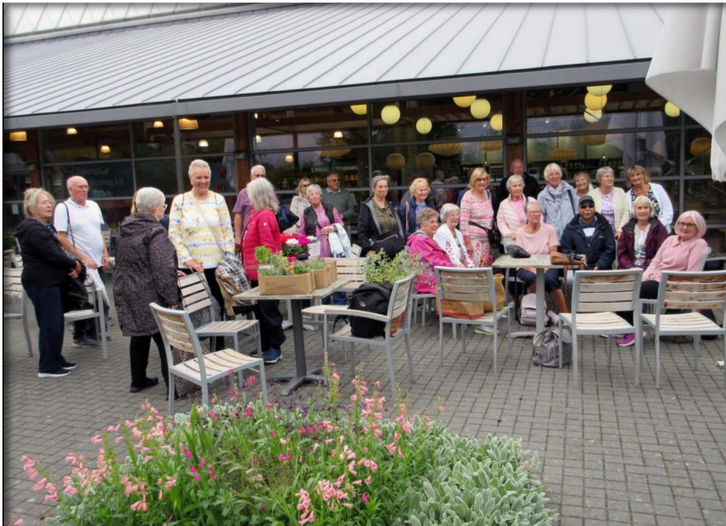
Gardening Group at Hyde Hall

Our next meeting is in Tesco Brookfield Community Room at 10:30am on Friday 11 th October 2024.